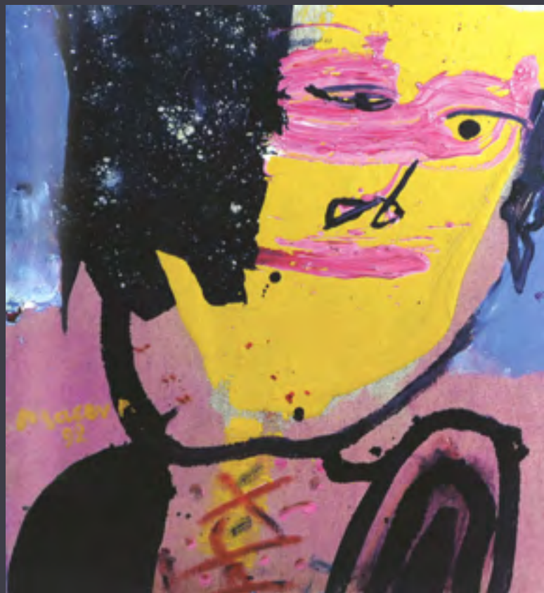
Petar Mazev, 1927-1993 Portrait, oil on canvas 80x70