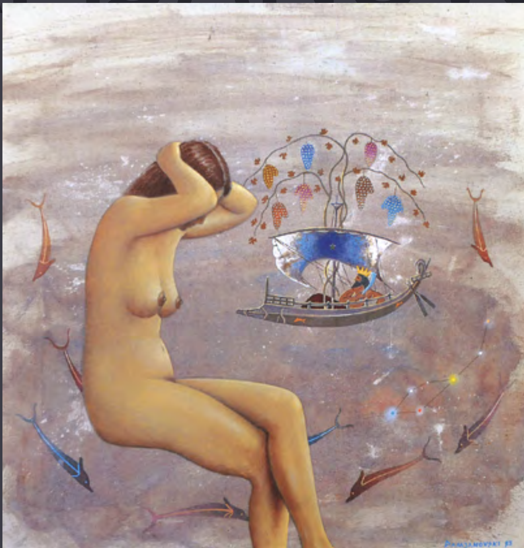
Bozidar Damjanovski, 1947 No title, oil on canvas 70x50