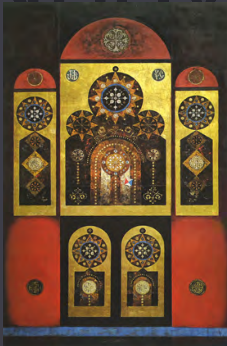
Dimitar Kondovski, 1927–1993 Polyptich portal 3, oil on canvas 100x70