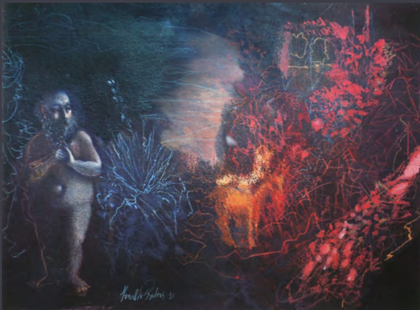
Rubens Korubin, 1949 No title, oil on canvas 70x100