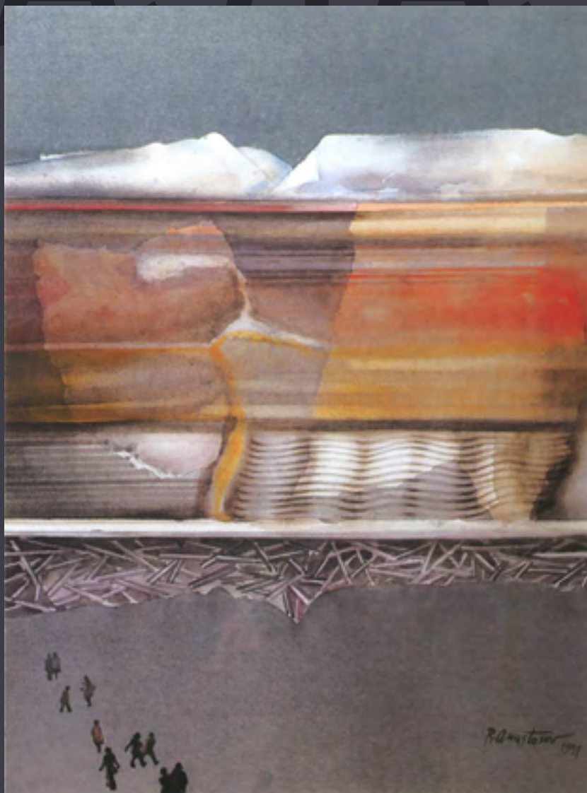
Rodoljub Anastasov, 1935 In search for the lost space, mixed media 70x60