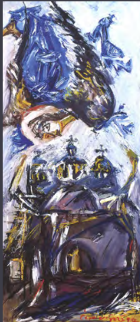
Gligor Cemerski, 1940 Angel of a church, oil on canvas 100x50