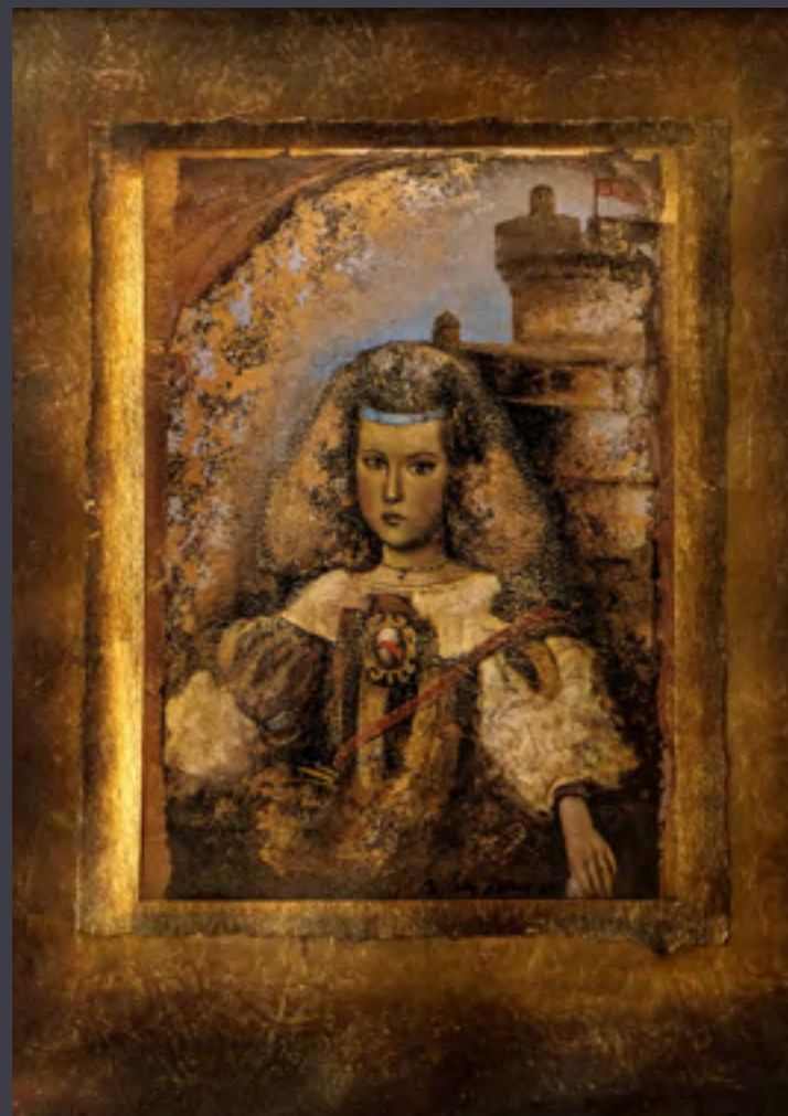
Mersad Berber, 1940-2012 No title, mixed media 70x50