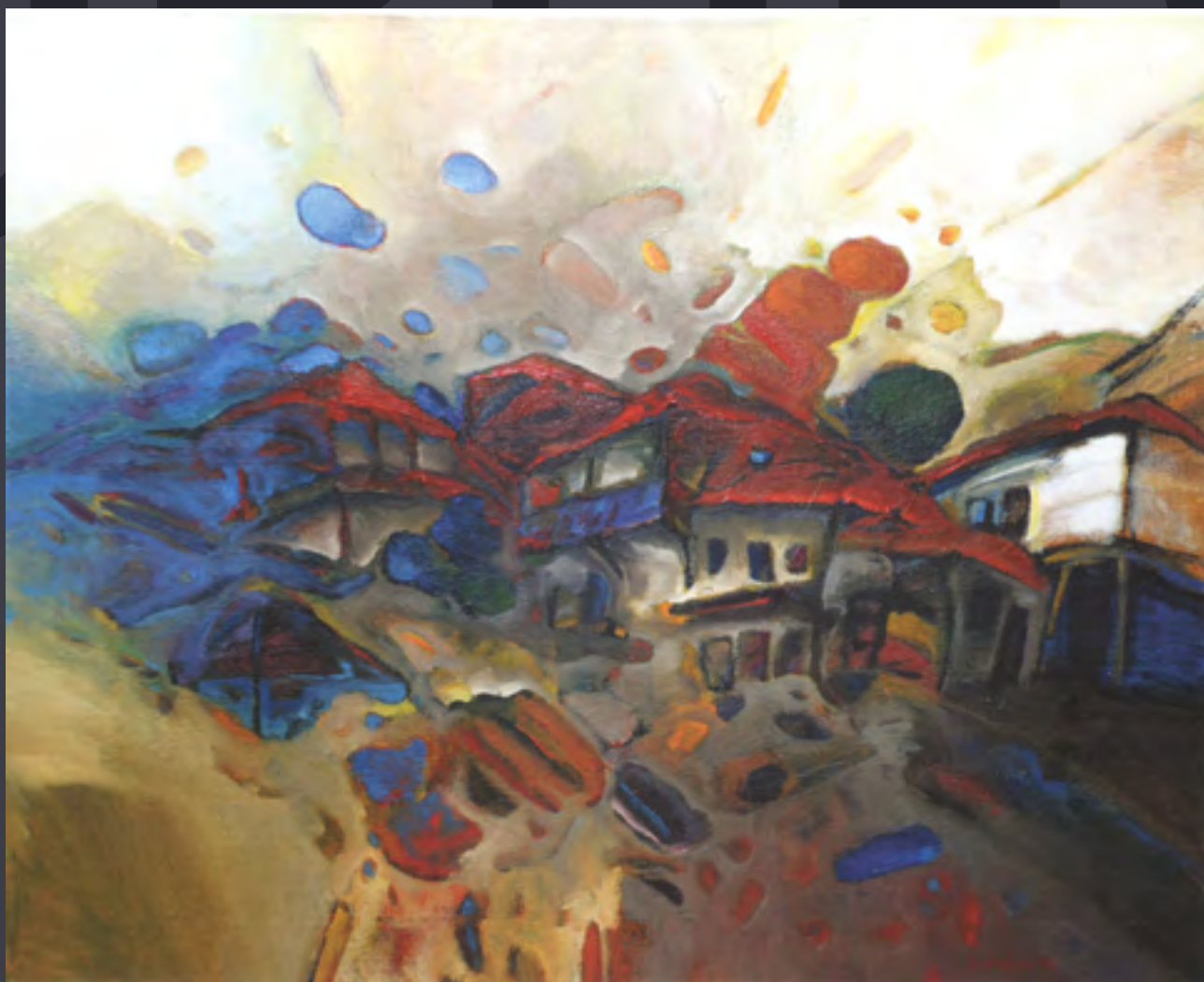
Danco Ordev, 1945 The village, oil on canvas 50x70