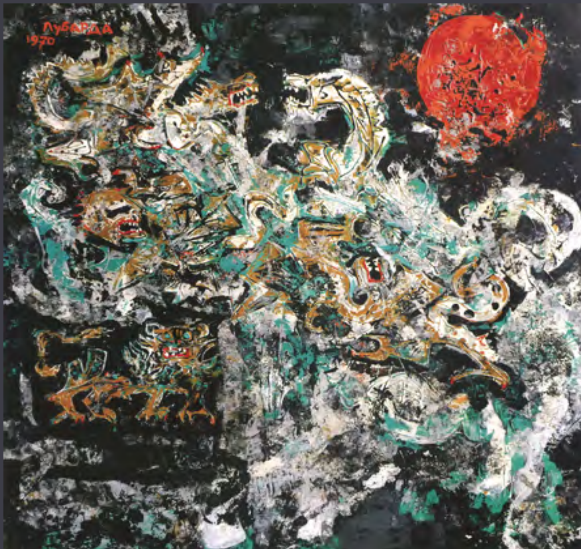
Petar Lubarda, 1907-1974 Return to the lake, oil on canvas 70x100