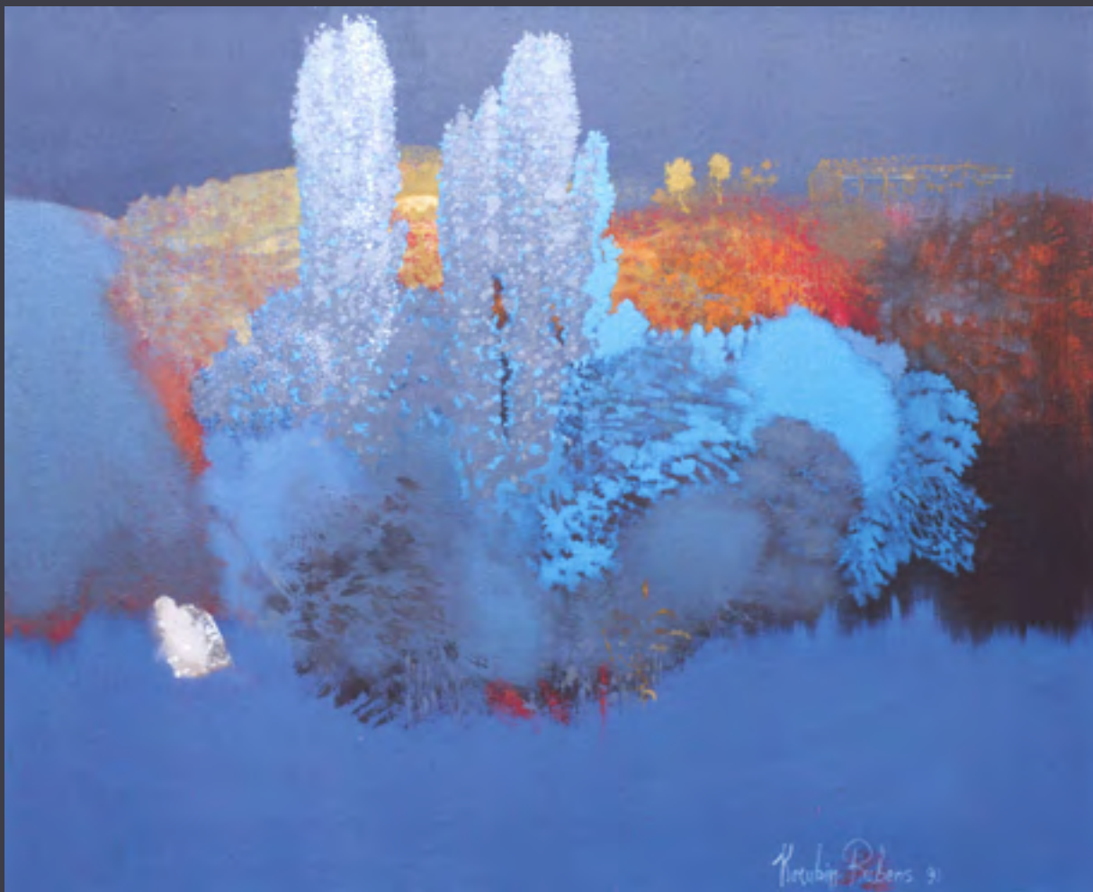
Rubens Korubin, 1949 No title, oil on canvas 70x100