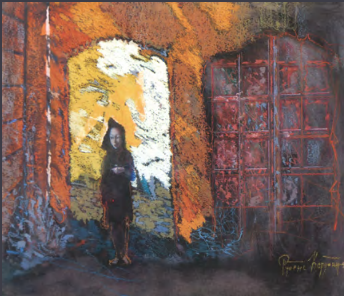
Rubens Korubin, 1949 No title, mixed media 70x100