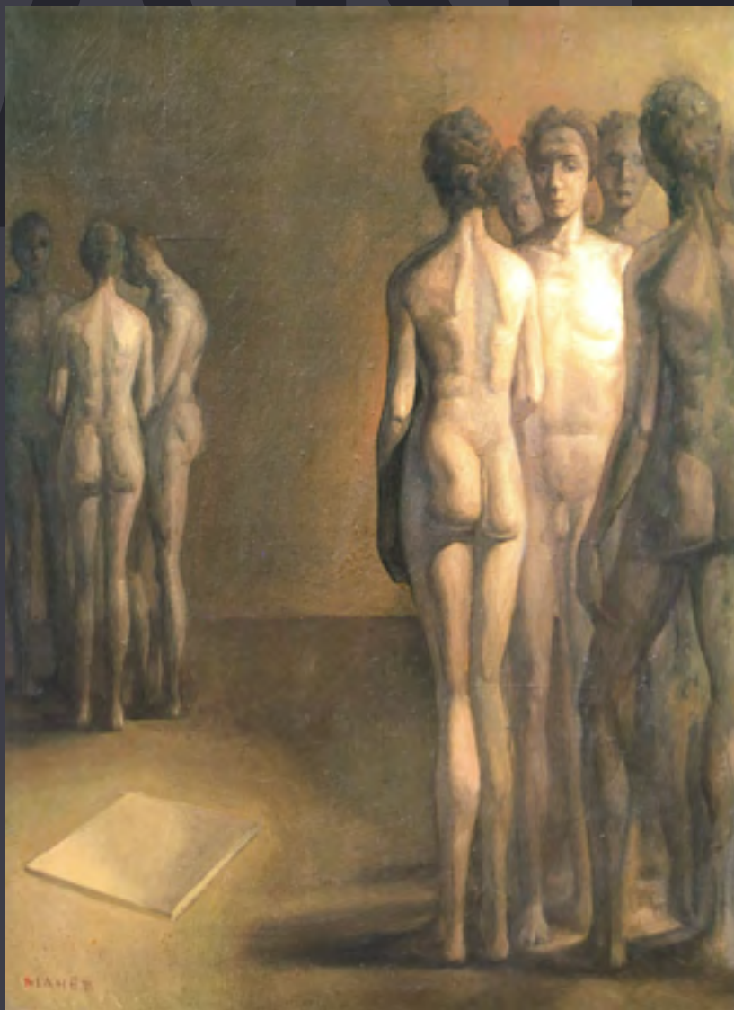
Kole Manev, 1941 Composition, oil on canvas 70x50