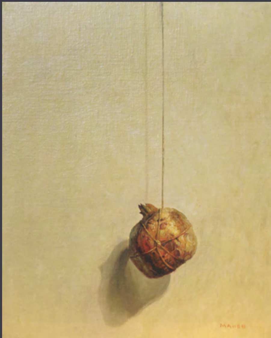
Kole Manev, 1941 Pomegranate, oil on canvas 70x50