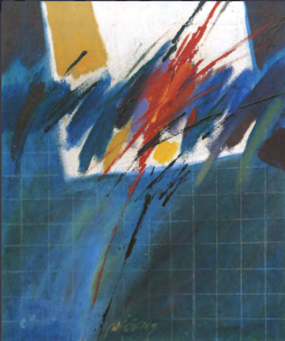
Dimitar Micho Kochovski, 1943 No title, oil on canvas 70x50